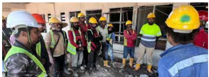
Safety awareness training at a construction site.